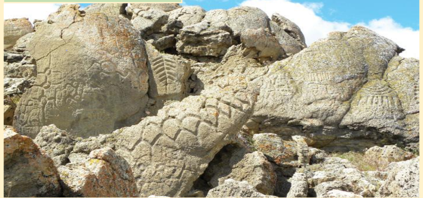
Winnemucca Lake Basin Petroglyphs