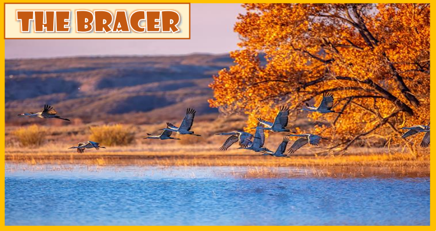
Ruby Valley, NV