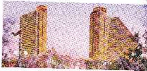
John Ascuaga's Nugget (2nd Floor West End Pavilion)